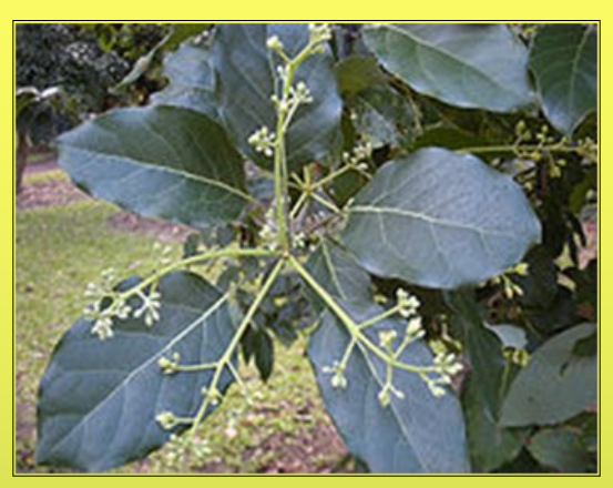
Inflorescence and leaves of avocado

Avocado tree grows to about 20m and has alternately arranged leaves which are 12–25cm long. The flowers are inconspicuous, greenish-yellow and 5–10mm wide.