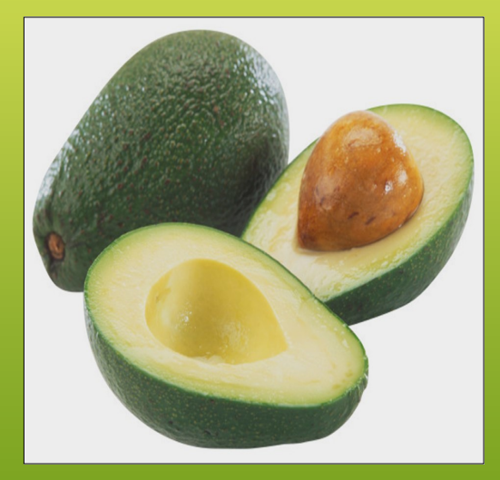
Pear-shaped fruit with a large central seed

The pear-shaped fruit is 7-20 cm long, weighs between 100-1,000g and has a large central seed which is 5-6.4 cm long depending on variety.